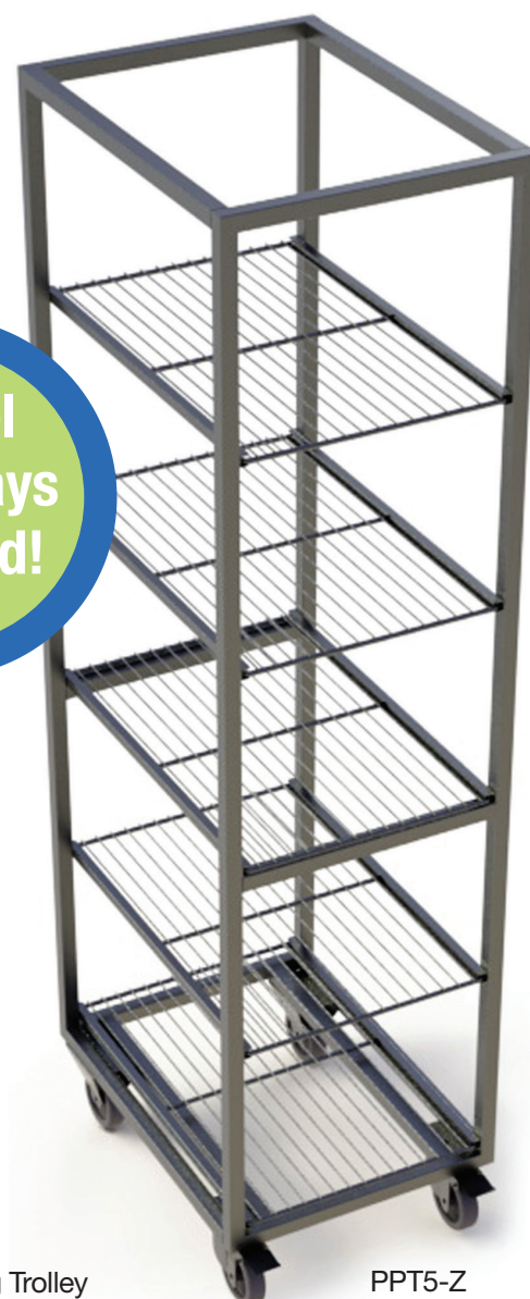
Pizza Proving Trolley