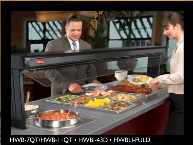
HWB-7QT/HWB-11QT • HWBI-43D • HWBBI-FULD