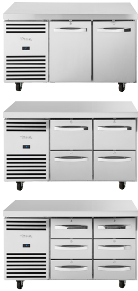
TCR1/2-CL-SS-DL-DR TCR1/2-CL-SS-D2-D2 TCR1/2-CL-SS-D3-D3