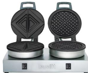
2 in 1 Toastie & Waffle Maker