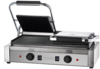
Double Contact Grill