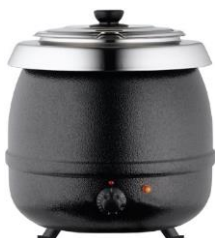
10L Soup Kettle