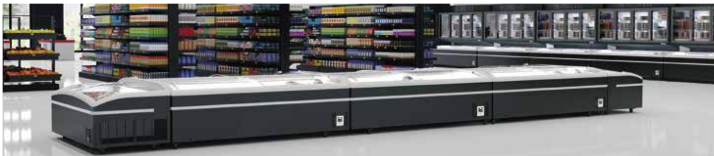
Black and anthracite options available