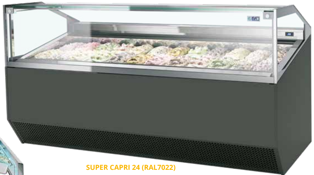
SUPER CAPRI 24 (RAL7022)